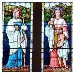
1 Corinthians 13 v 13

Now these three remain: faith, hope and love. But the greatest of these is love.