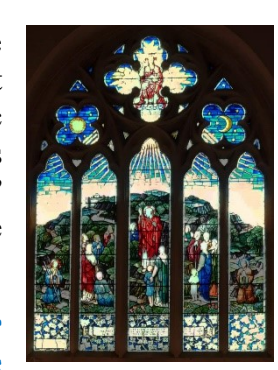
Matthew 5 v 3

'Blessed are the poor in spirit, for theirs is the kingdom of heaven.'